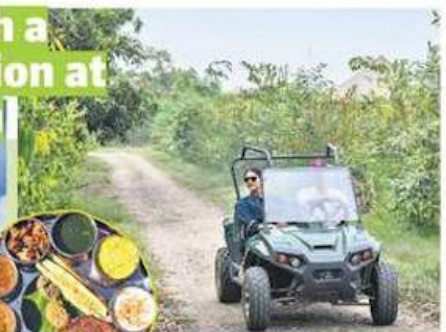
Enjoy scenic views at Aalia Jungle Retreat & Spa, Haridwar

Wondering how to celebrate Independence Day? Embrace luxury at Claridges Collection - The Claridges Nabha Residence, Mussoorie and Aalia Jungle Retreat & Spa, Haridwar for a