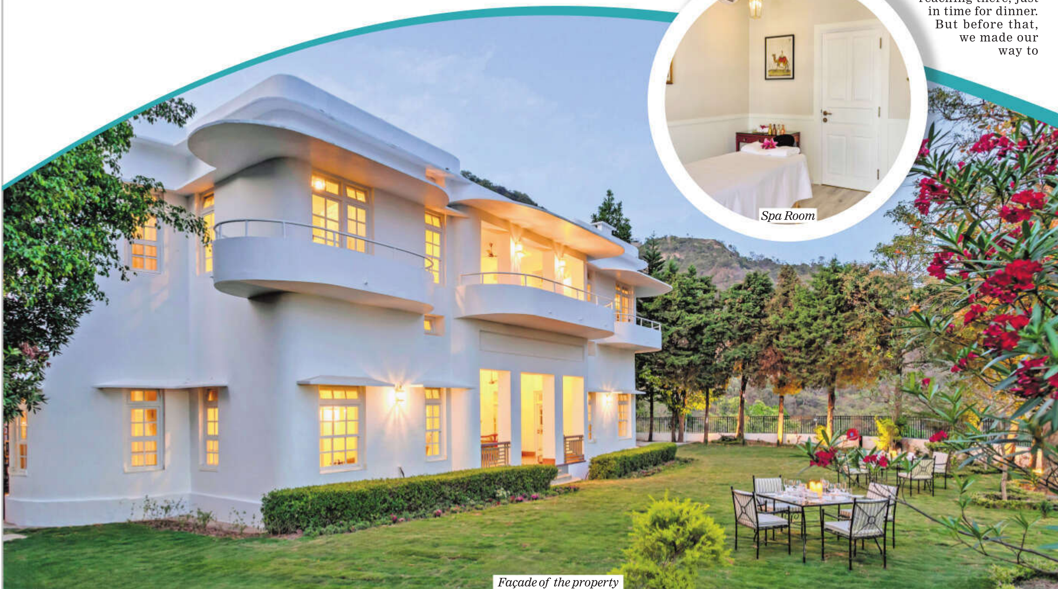
Façade of the property